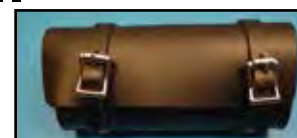
Heavy Leather Tool Bag with duo strap measures 10" x 4½" x 3" and is 8 oz. leather. Full grain top leather is tanned oiled and wax treated. Features 4-way adjustable straps for easy mounting. VT No 48-3113