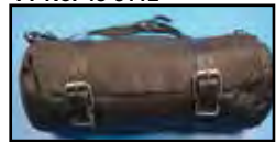
Soft Leather Tool Roll features fully padded inside zipper and velcro secured flap. Includes two heavy leather mount straps with roller buckles. The tool roll measures 11½ L x 4" W x 4¼" H. VT No. 48-3116