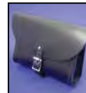
FLH Windshield Pouch. Windshield bag. Heavy oily leather, glued, sewn, riveted. Black, 9" x 3" x 6". VT No. 48-3125