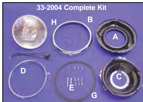
33-2004 Complete Kit