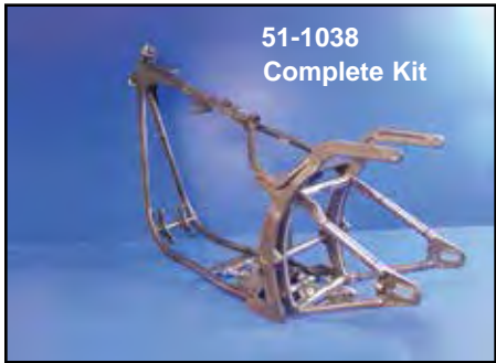
51-1038 Complete Kit