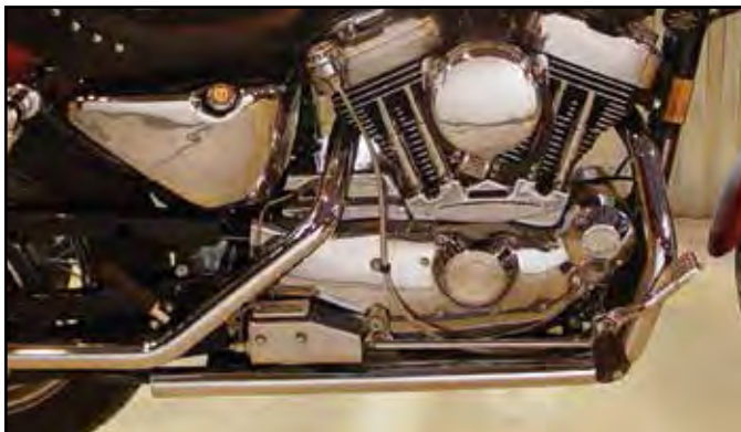
1991-2003 Right Side