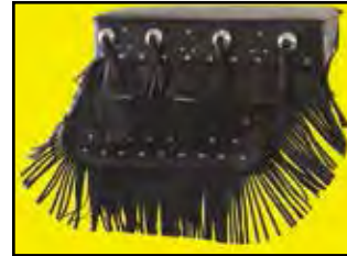
Bertha FL 1964-84 Bags

Bertha Bag Sets measure 20" x 14" x 7". Feature full leather construction, with fringe and 1/2" chrome spots. 1964-84 FL fit stock fiberglass saddlebag brackets.