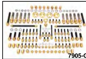
Cap Acorn Acorn