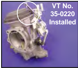
VT No. 35-0220 Installed