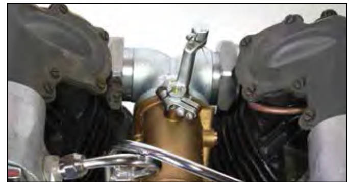
49-0635 Installed on Knucklehead Motor