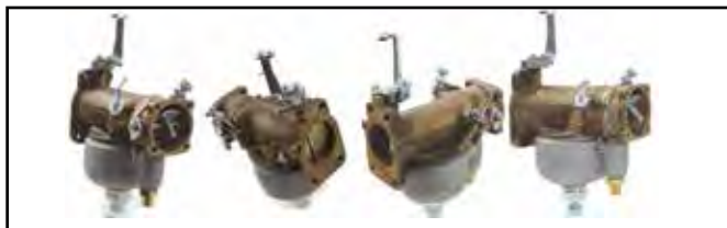
VT No. 60-0148