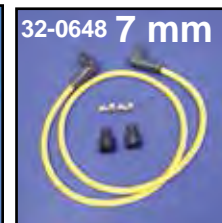
32-0648 7 mm