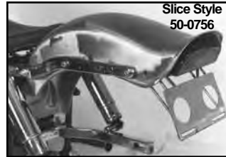
Slice Style 50-0756