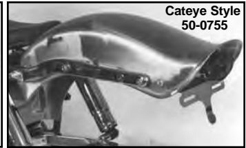
Cateye Style 50-0755