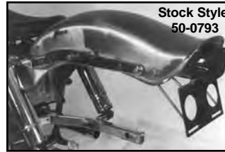
Stock Style 50-0793