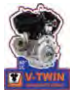
48-0498 80" UL