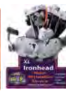
48-0372 XLCH 1971