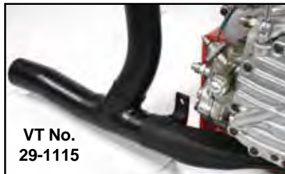
VT No. 29-1115

Replica Knucklehead Motor is fitted with V-Twin Mfg.'s exclusive replica exhaust system produced with our world exclusive tooling and fixtures.