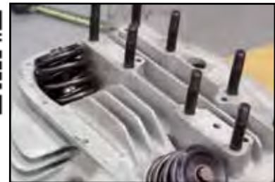
Motor Shop Valve Service and Replacement