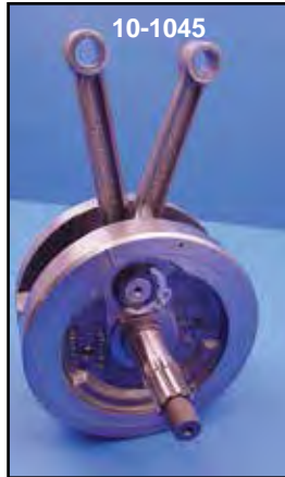
Replica Flywheel with stock rods