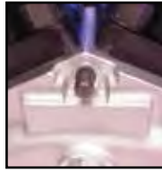
Details of 10-1988