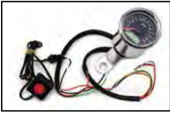
2" Mini Electronic Speedometer fits 1997-up FX. VT No. 39-0464