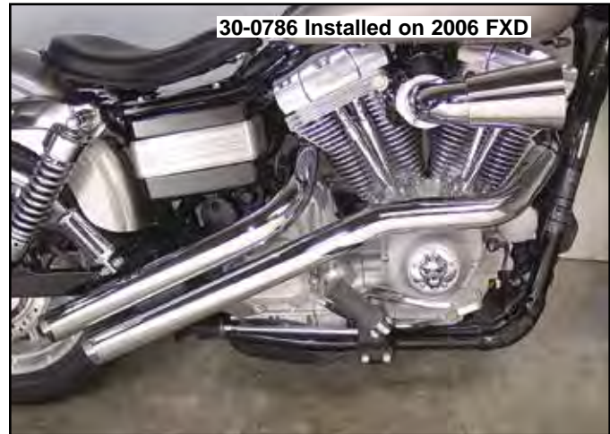
30-0786 Installed on 2006 FXD

Sweeper Exhaust fits FXD models including 2006-up models with oxygen sensors. Pipes are 1 1/4" to 2 1/4" at end portion. Bracket included. Order baffle separately.