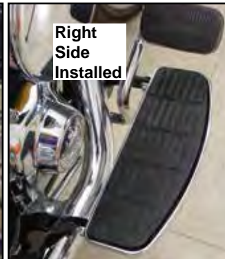
Right Side Installed