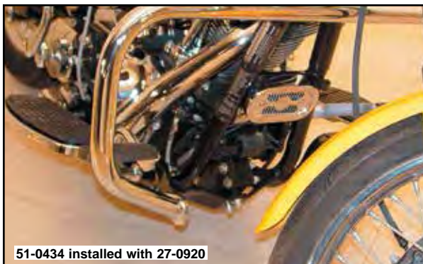
51-0434 installed with 27-0920