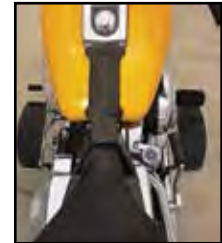
Chrome Engine Bar features 1/4" tubing. VT No. 51-0434