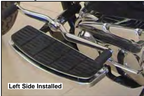
Left Side Installed