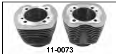
95" Silver Cylinder Sets. VT No. 11-0073