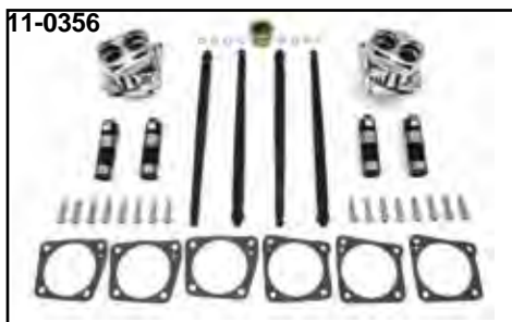
Sifton Chrome 1986-99 Tappet and Pushrod Assembly includes four tappet units, four pushrods and a tappet base set with screws and gaskets.