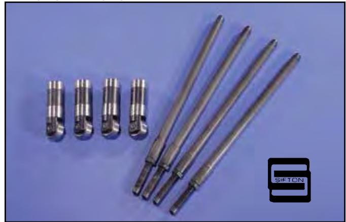
Sifton Solid Tappet Kit for Evolution 1340 includes four (4) solid tappets, standard size, with rollers installed and four (4) adjustable pushrods.