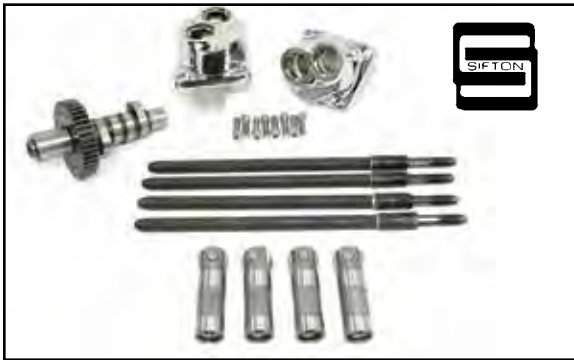
Sifton Performance Cam Kit includes cam E-Z install pushrods, chrome tappet bases and roller tappets. .495 lift. Fits Evo. VT No. 11-1600