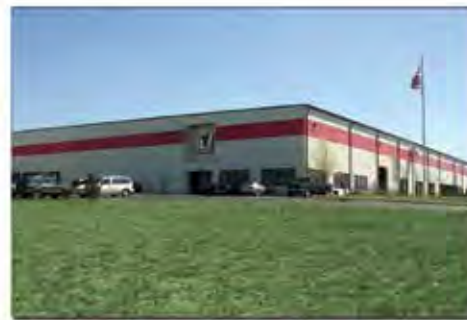
Kansas City, MO Warehouse

V-Twin Mfg., your original aftermarket supplier since 1968!