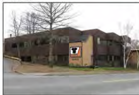
V-Twin Mfg. Call Center

V-Twin Mfg., your original aftermarket supplier since 1968!