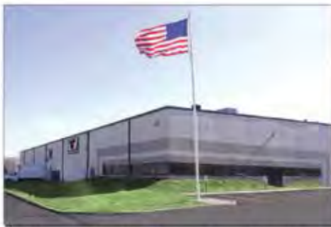
Newburgh, NY Motor Shop Ready & Warehouse