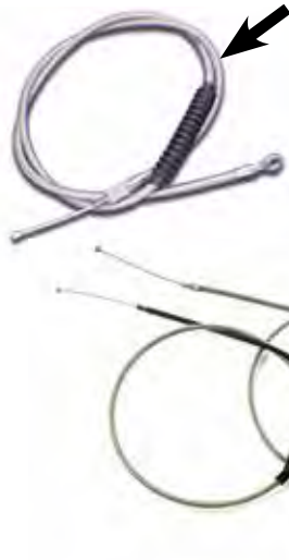
Full Stainless Braid Covering with Clear Coat