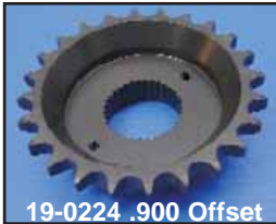
19-0224 .900 Offset

Offset Transmission Sprockets fit 1994-2003 Big Twin for chain drive conversion... .900 offset is the maximum offset without any modification to the stock inner primary, to allow the installation of a 180 tire, without transmission offset. Fender modification may be required.