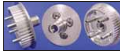
1984-90 Big Twin Clutch Hubs feature the updated factory construction which has a machined steel center with aluminum outer

splined ring, secured by allen screws, with steel studs welded in place. Order related hardware separately.