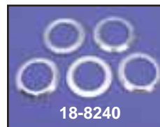
1985-90 Clutch Hub Sleeve is a reinforcement ring for hubs at the tapered end. Sleeve is pressed on with beveled side out toward inner primary, after clutch drum with bearing is set over hub, so that clutch drum and hub will be installed as one unit.