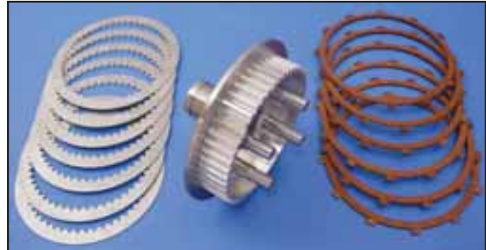
1984-89 Big Twin Clutch Hub Kit includes updated reinforced steel center clutch hub, steel drive plate set & friction plate set.