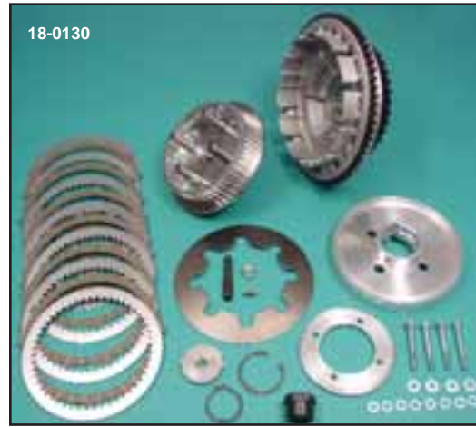
Complete Assembly 1985-90. VT No. 18-0130