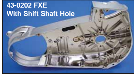
43-0202 FXE With Shift Shaft Hole

Chrome Inner Primary Trim easily adapts to stock cast inner primary without complicated disassembly. Fits 1970-84 FX-FL. VT No. 42-0314