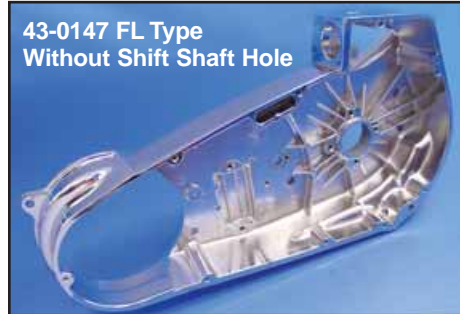
43-0147 FL Type Without Shift Shaft Hole