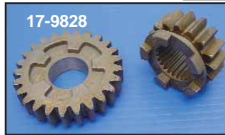
5-Speed Close Ratio 2.94 Low Gear Set closes the gap between 1st and 2nd. Adds about 5 m.p.h. of usable 1st gear. Replaces 35025-79C 1st mainshaft, 35622-79C 1st countershaft.