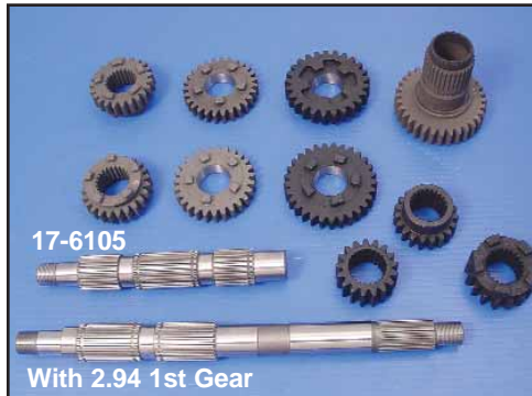
Complete Gear Set with 2.94 1st Gears. VT No. 17-6105