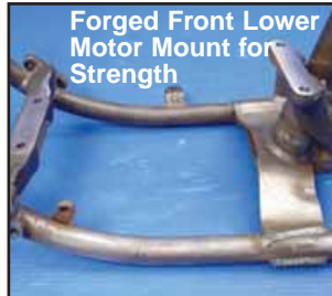
Forged Front Lower Motor Mount for Strength