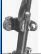
Swing Arm Pivot Points Forged Steel as Original