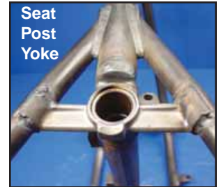
Seat Post Yoke