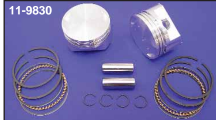
Note: All Wiseco Rings are sold per piston.