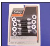
Chrome Rocker Box Screw Set fits 1985-99 Big Twin.