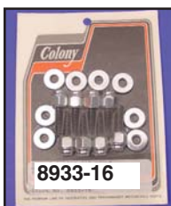
Rocker Box Screw Kit for Evo includes chrome allen screws and washers, and copper sealing washers.