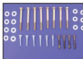
Evo Big Twin Lower Rocker Box Mounting Hardware Set includes all correct bolts, allen screws and washers necessary for bolting lower rocker cover to cylinder head. Complete set for two heads.