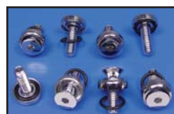
"Tru-Seal" Evo Rocker Box Cover Collar and Screw Kit includes sealing washer with built in O-Ring for position seal.