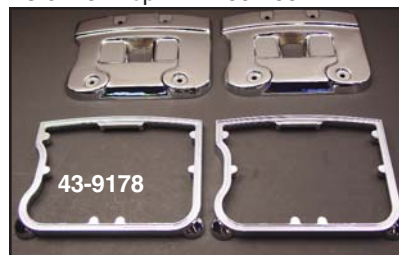
Chrome Top Cover & D-Ring Set order gasket separately. Fits 1984-81. VT No. 43-9178

Available in pairs. Order gaskets and screws separately. VT No. 43-0142