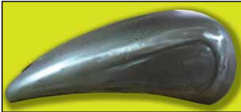
Indented Side Panel Styles