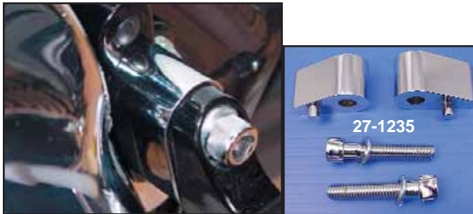
51-1601 Installed shown with 27-1235