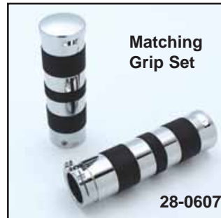
Matching Grip Set

Chrome Forward Control Adapter Plate Set will mount 1986-99 ST forward controls to 1991-up FXD. VT No. 22-0585