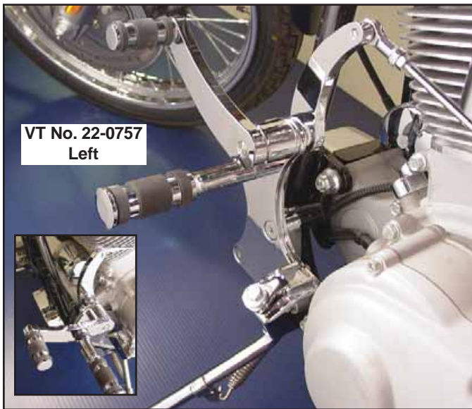
VT No. 22-0757 Left