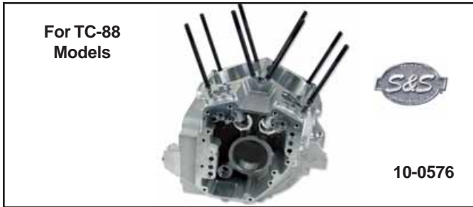
For TC-88 Models