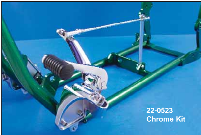
22-0523 Chrome Kit

Brake and Shifter Kits. Order footpeg, left and right side separately.