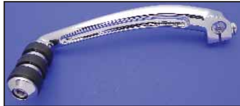
Billet Lever with Cats Paw Peg for 1990-up FXST, 1991-up FXDWG. VT No. 21-0690