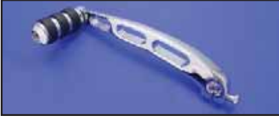
Slotted Billet Lever with Cats Paw Peg. VT No. 21-0691