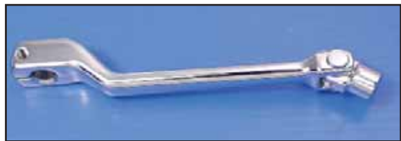
Heel Shift Lever features swivel peg location, to fold out of the way fit 1986-up FLST, 1988-up Touring. VT No. 21-0471

Heel-Toe Shifters feature internal spline for 1983-up FLT Touring models.