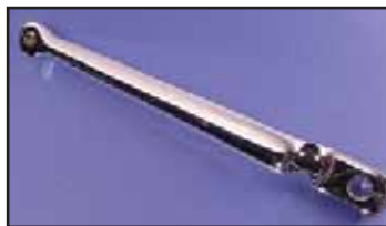
Extended Chrome Shift Levers are 8 1/2" long for extended reach. Fits 1986-2005 FLT. VT No. 21-0256