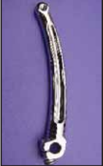
Chrome Billet Shift Lever fits 1990-up FXST models. 1991-up FXDWG. VT No. 21-0221