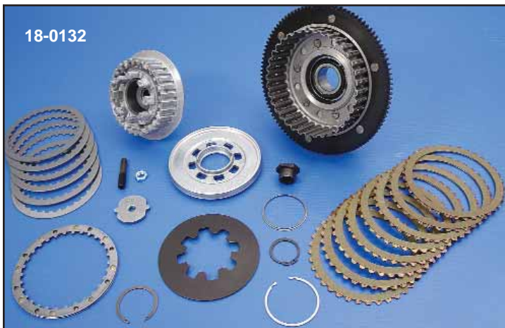
Complete Clutch Pack Assembly as shown.