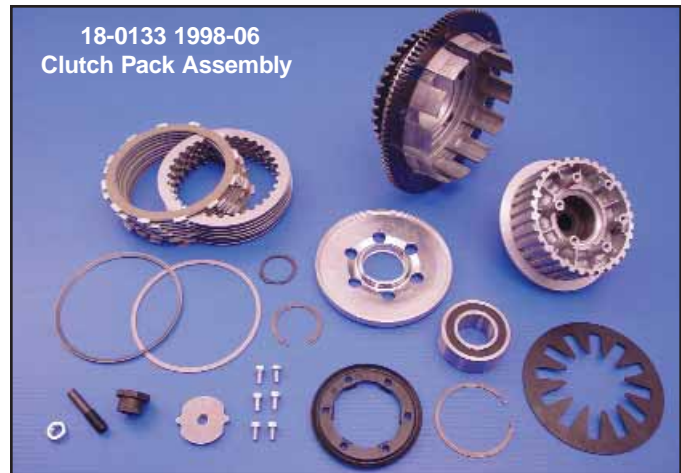
Order VT No. 18-0133 Complete Assembly 1998-06 5-Speed