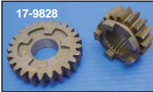
5-Speed Close Ratio 2.94 Low Gear Set closes the gap between 1st and 2nd. Adds about 5 m.p.h. of usable

1st gear. Replaces 35025-79C 1st main, 35622-79C 1st countershaft.