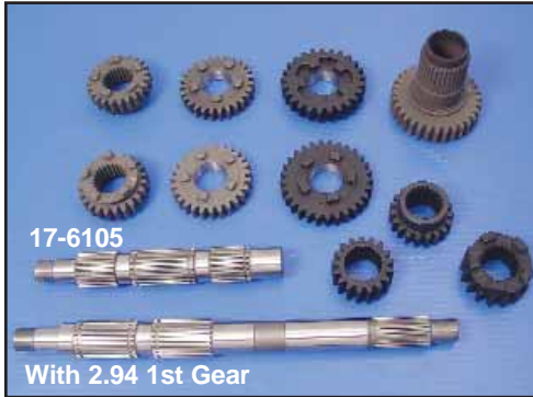
Complete Gear Set with 2.94 1st Gears. VT No. 17-6105