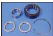
Left Bearing Kit fits 2003-up TC-88 left side crank shaft. VT No. 12-1544