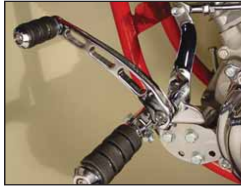
Chrome Billet Shift Lever features slotted design fits 1990-up FXST and 1991-up FXDWG. VT No. 21-0670