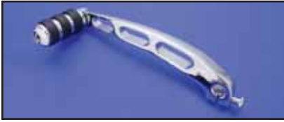
Slotted Billet Lever with Cats Paw Peg. VT No. 21-0691