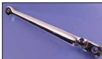
Extended Chrome Shift Levers are 8 1/2" long for extended reach.