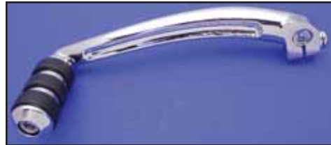
Billet Lever with Cats Paw Peg for 1990-up FXST, 1991-up FXDWG. VT No. 21-0690