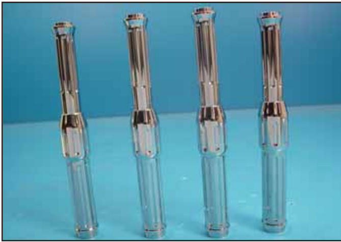
1984-99 Chrome Billet Pushrod Cover Kit includes all pieces and seals for complete installation on Ev BT models. VT No. 11-0947