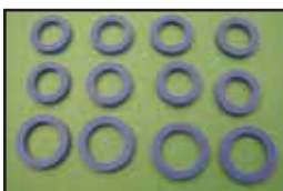
Pushrod Cover Rubber Seal Kit includes 12 machined rubber seals for Big Twin Evo. 1984-99.