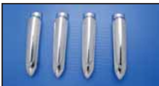
Chrome Machined Pushrod Clips fit Evo or Shovel Motors, set of 4.